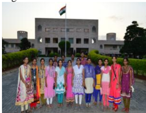
Students at ISB