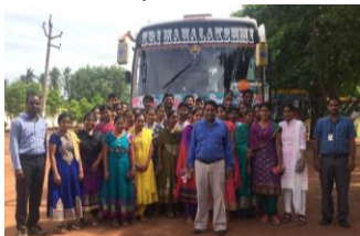
Students gathering for Radar Centre