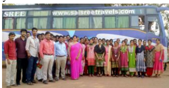
Students gathering for Efftronics