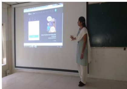
Student presenting her views on the topic