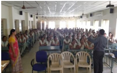
Head of the department addressing the students